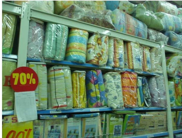
Figure 1 Comforters are now a common item in every major retail outlets in Malaysia

In Malaysia, the word comforter denotes a blanket type consisting of two layers of sheet, filled in between with natural or synthetic insulative material such as polyester wool. A queen size comforter weights between 0.7 to 1.5 kg. The insulating property can be anywhere between 3 to 5 clo. Unlike tog rating available for duvets in the UK, there is no standard rating for the insulating property of comforters in Malaysia.